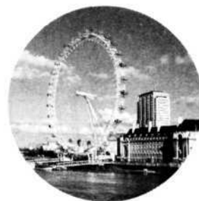
The London Eye