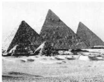
A The Pyramids

Finally we'll take you back to Cairo. On the last day of your holiday you'll 10 ..... a camel in the desert! You'll 11 ..... with Egypt. You 12 ..... disappointed.